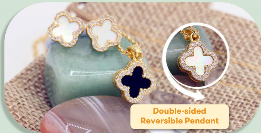
Double-sided Reversible Pendant